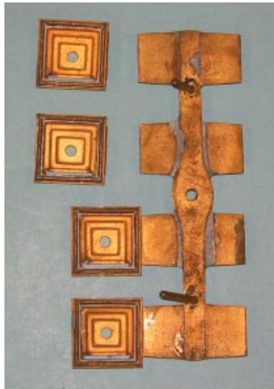
Photo 8. Pattern tree for the top of the High Rise building bank flipped over compared to Photo 7.