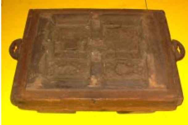
Photo 9. This match mold is 16 1/2" wide and 13 1/2" deep. Including the standoffs on the base it is 2 3/4" high.

Photo 9 shows a match mold and Photo 10 the complimentary pattern tree. The mold probably is for the base of a toy stove; it does not correspond to the bases of any of the safes in the Iron Safe Banks book. 3