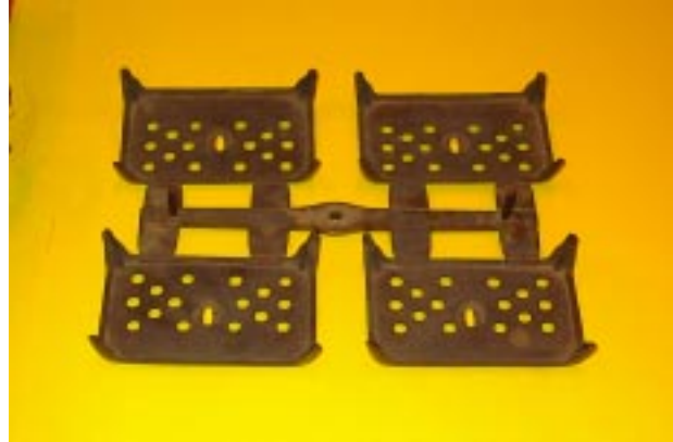
Photo 10. Pattern tree that is complimentary to the match mold in Photo 9.

Photo 11 shows the pattern tree in the match mold with a snap flask added. The flask is too small for the match mold but is shown nonetheless to illustrate the state depicted in Figure 3(a) of the Penny Bank Post paper. At this stage the molder would be ready to add a layer of facing sand and then to fill the mold with molding sand.