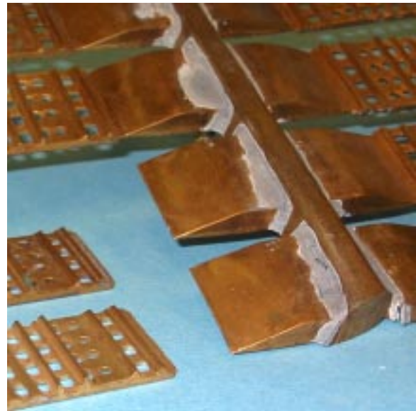
Photo 6. Close up that shows how the gates of each working pattern were attached to the runner of the pattern tree.

The purposes of the hole in each "O" and the two pins were explained by John Mahon. After the sand mold was completed (see Figure 5(a) of the "Patterns and Molding of Cast Iron Still Banks" paper) a tapered wooden dowel was engaged in the hole. This allowed the molder to lift the pattern tree from the mold, and the pins ensured that it would come straight out. Both features reduced the chances that the mold would be disturbed when the pattern tree was removed. (Mahon believes that these features will not be found in pattern trees from all foundries.)