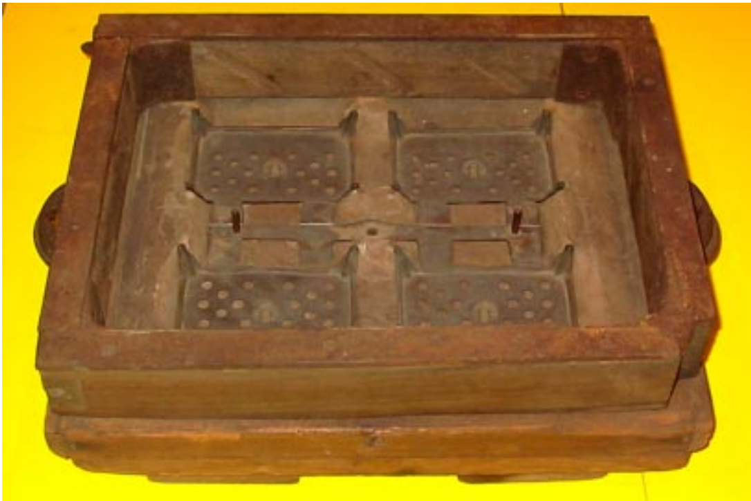
Photo 11. Match mold with the pattern tree in place.

Photo 11 shows the pattern tree in the match mold with a snap flask added. The flask is too small for the match mold but is shown nonetheless to illustrate the state depicted in Figure 3(a) of the Penny Bank Post paper. At this stage the molder would be ready to add a layer of facing sand and then to fill the mold with molding sand.