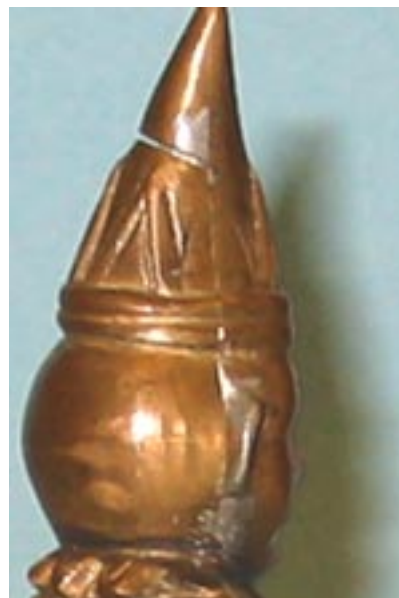
Photo 3. Note how solder has been applied to the hat and the area of the ear.