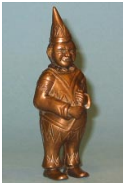
Photo 1. Brass working pattern for a "Clown" bank similar to M-211.

In his seminar Bill Robison explained that after a working pattern was cast it was "perfected," meaning that it was touched up to repair defects and sharpen details. Where necessary to fill voids, solder was applied and shaped. Photos 1 to 3 show a working pattern for a "Clown" bank similar to M-211. 2 In Photo 2 a repair to the side of the right leg is apparent and in Photo 3 repairs to the hat, ear, and neck can be seen.